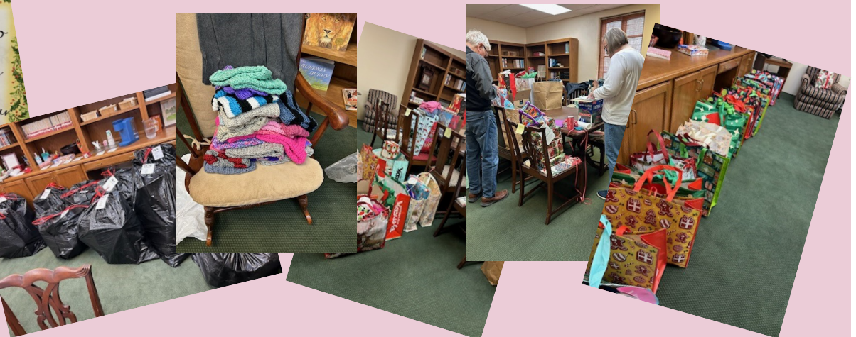
Members of the Benevolence Team prepared Angel Tree gifts for 30 children